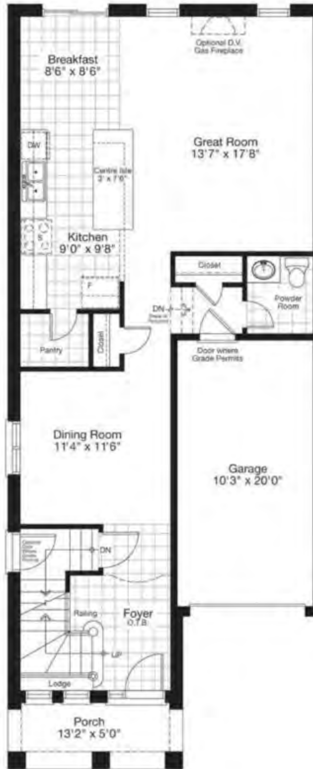
Main Floor Plan Elevation A